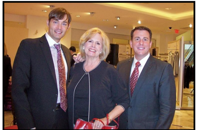
Thank You Neiman Marcus Willow Bend

Community Service: NWC enjoys a rich history of volunteer activities. This year the organization contributed a total of 12,632 hours for community service.