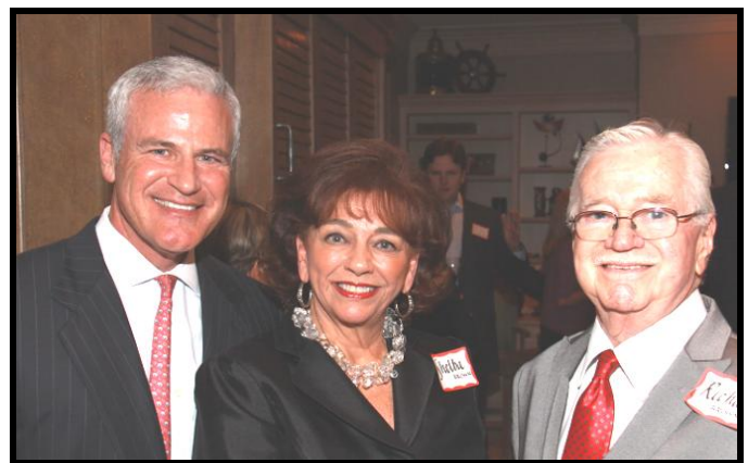
Thank you Northern Trust