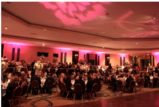
A beautiful event