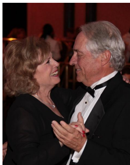
Dancing the Night Away