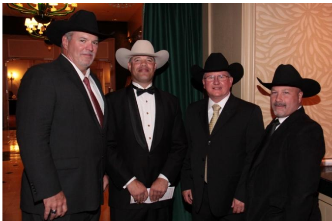
Auctioneers Ready To Go